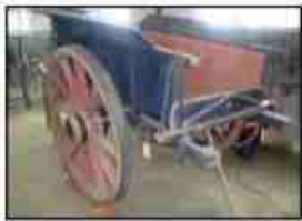
The tip cart made in 19th C and used at a farm in Foxton, Cambs, now destined for Audley End

Secondly, the Museum is giving a blue and red-painted tip cart, originally used at Foxton in Cambridgeshire, to English Heritage for Audley End Stables. The cart will be used with Bob, the Stables' resident draught horse, for light work around the grounds, as a living demonstration of horse-powered transport on a working 19th century estate. Vyvyan Veal, who is a volunteer and Bob's keeper at Audley End, has been training Bob and has measured up the cart to make sure that it fits the horse. We wish him and Bob well and look forward to seeing them round the organic garden and grounds in the future.