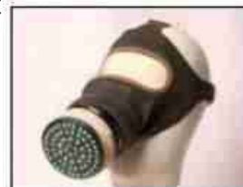
Gas mask: one of the items in the upcoming exhibition

My first task was to compile a list of potential objects and this has really helped me to get to grips with our collections. We have a huge number of objects that could be used in the exhibition - from gas masks to ration books, sculptures to letters, uniforms to in memoriam cards — so the hardest part has been trying to narrow it down! The exhibition will be based around six themes, including the Home Front, the role of women, the presence of soldiers in the District and remembrance. Within each theme, there will be personal stories and photographs to highlight the impact of the war on individual lives.