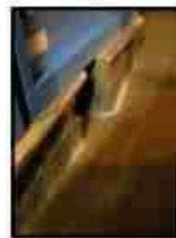
L: White mould growth

It has been very busy in the Museum since the spring. The flooded store continues to absorb time. It was so damp that blooms of mould grew over the breeze blocks that were used to raise cabinets of natural sciences specimens off the floor and above flood level.