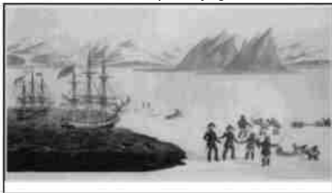
First encounter between the Navy and the Inuits. 1818