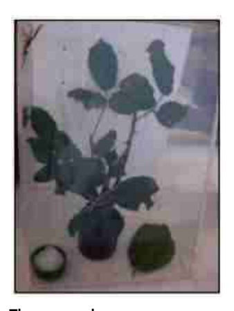
The nursery box

Other news! Racking has been installed by Link 51 in the Natural Sciences store in the new Store (see illustration on left). Handover and training in the operation of the mobile racking was carried out on 30th October.