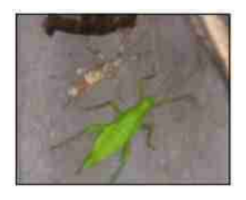
The female stick insect grows to 20—25 cm in length

Seven baby stick insects have hatched from eggs laid by the adult female giant Malaysian stick insects. They are housed in a box in the cage to keep them together in a nursery until they are bigger in size. It has been a very exciting time, with new babies hatching out over a period of 3 weeks and now there is the anticipation of whether they will grow up to be male or female. Adult females will be bright green and the males will be brown.