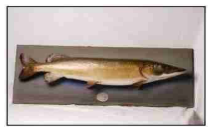
Pike called Big Bertha