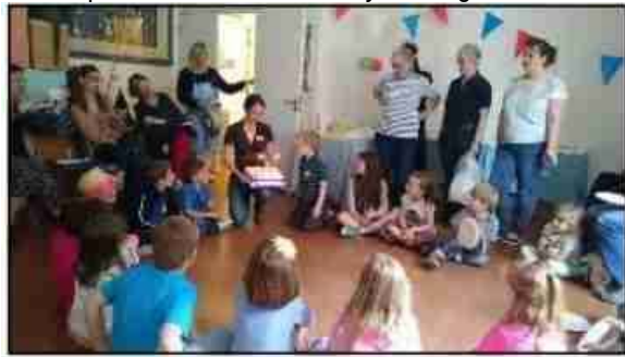
Birthday cake in the school room To top it all off, we even had a visit from a very friendly 'real', 'live' Wallace the lion, who the children absolutely loved. Wallace joined in with lots of our games, including sleeping lions, as well as being available for plenty of high-fives and cuddles!

May half term saw two big events take place in the Museum and museum grounds. We celebrated the Museum's, slightly belated, 180th birthday by holding parties for children from the local community. 40 children and their families came along and enjoyed a museum treasure hunt, traditional party games, a birthday tea and a spectacular cake made by Dorrington's bakers.