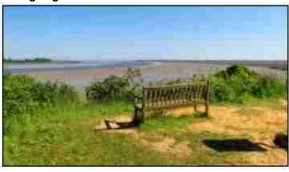
7th July Visit to Fingringhoe Wick

Eight of us arranged ourselves into two cars and set off for 'The Wick' along the A I20 and, winding through Colchester, emerging suddenly into the lanes beyond. It was breezy. cloudy but getting warmer and having picnicked in the visitor centre, we began to decide where to go first. For two of us it was the hide that overlooks 'The Scrape' on the east salt marsh. most of which is an army firing range, On the little island in The Scrape itself, there were black headed gulls, some nesting, and a lone oyster catcher while on the marsh were starlings, curlews, more gulls- black headed, greater black backs and one Mediterranean gull spotted by a very good 'birder' in the group.