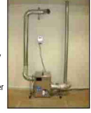
The dehumidifier system

This summer. the store team volunteers also completed the packaging of the biology and geology collections - they have packed up no fewer than 994 boxes, drawers and individual specimens! On 20thOctober we'll finally start to move objects into the new store.