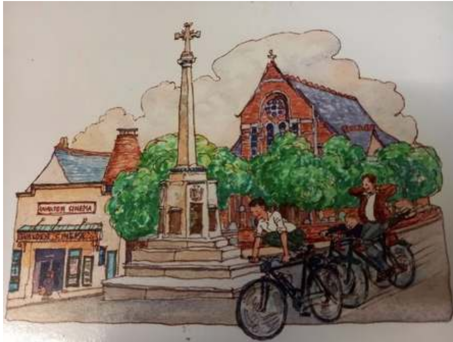
image from his book "Evacuee: A Wartime Childhood" (2010)