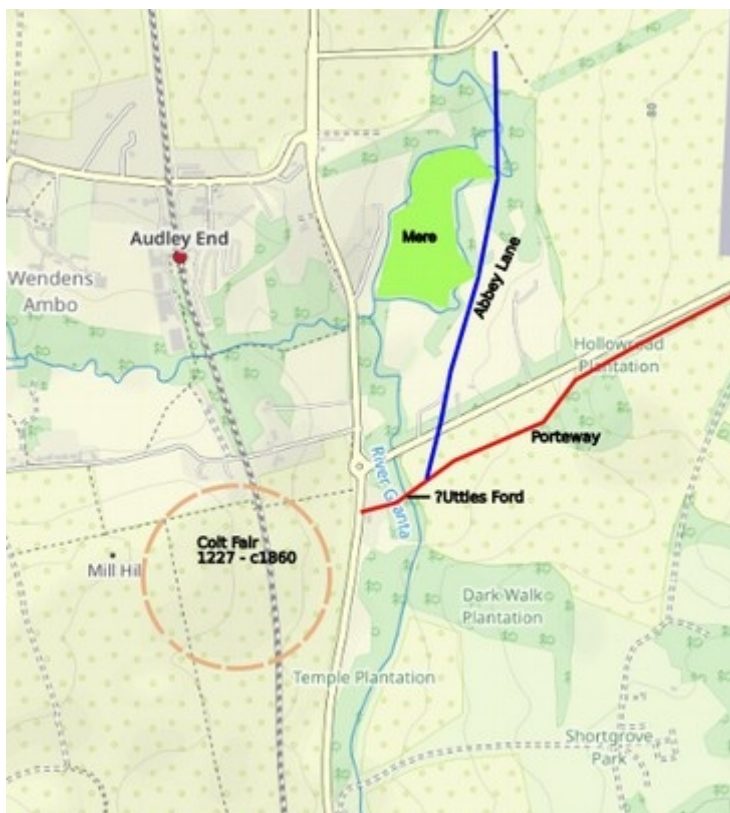
Drawing by Tony Morton based on Simon Coxall's original Map Base "© OpenStreetMap "

The area around the junction of the modern Sparrows End Hill and London Road made a good case study. The oldest roadway here was the riverside lane which Simon Coxall calls ‘Abbey Lane’ passing through modern Sparrows End Farm along the riverside to the Abbey Farm, crossing the modern grounds of Audley End house (then meadow land), to Duck Street Farm, and then to Springwell. At the Norman conquest the Mandevilles obtained a right to hold a market at Walden, and built the castle, and also built new more direct roads from Springwell to Walden, and Walden to Sparrows End, where a ford across the River Cam, the Uttles Ford lay. This road was called ‘Porteway’ running a bit south of modern Sparrows End Hill, and crossed the river roughly behind the second house south of the modern roundabout. Simon Coxall calls this ‘Black Swan Ford’, because that house used to be a public house of that name, ‘The Black Swan.’ Surrounding field patterns shown by crop marks indicate a landscape of fields older than 1146, which were cut by the Porteway, showing it to be later. The Abbey Lane did not cut across fields and followed their boundaries. Both routes have now of course disappeared, replaced by later roads.